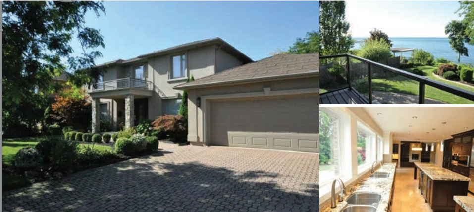
ST. CATHARINES WATERFRONT MLS: H3164962 • LIST: $1,475,000

Completely renovated exterior and interior, custom cabinetry, granite counters, built-in appliances, hardwood & Travertine marble tile floors, designer light fixtures, lake views from the yard and balcony.