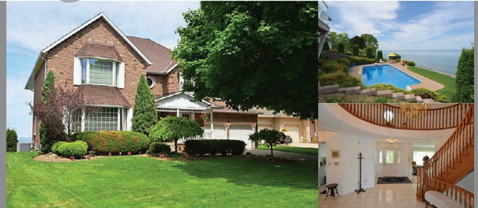
GRIMSBY WATERFRONT MLS: H3132593 • LIST: $1,399,000

Completely renovated exterior and interior, custom cabinetry, granite counters, built-in appliances, hardwood & Travertine marble tile floors, designer light fixtures, lake views from the yard and balcony.