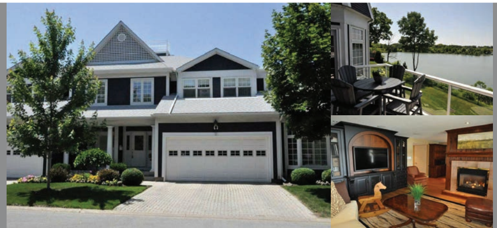
PORT DALHOUSIE WATERFRONT MLS: H3161370 • LIST: $879,000

3 Level custom on 16 mile pond w/7 bedrooms, 5 baths, fin lower level, 3 car garage, workshop, dining room, home office, sun room, eat-in kitchen, gas fireplace, full wheelchair access w/elevator.