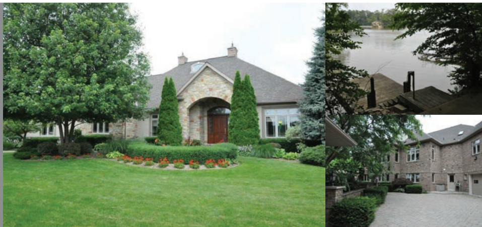
LINCOLN WATERFRONT MLS: H3164953 • LIST: $1,399,900

One of the best luxury homes on the lake. Over 5000 sqft, stunning lake front views, private beach, in-ground pool & patio. Kitchen & family room overlook lake, fireplace, formal dining room.